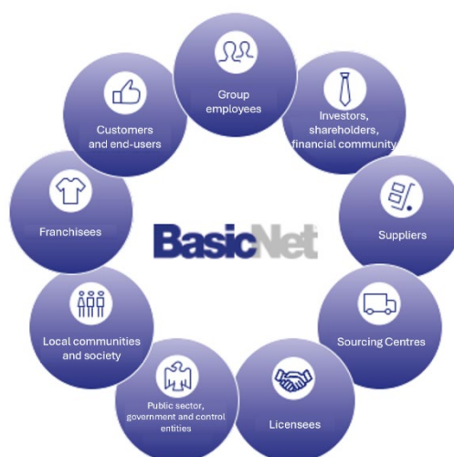
Figure 1 BasicNet Group stakeholders

To ensure effective, uniform pursuit of its goals that makes the most of the roles and potential of its stakeholders, the Group participates in various trade associations (such as Federazione Manageritalia, the Turin chapter of ASCOM - Confcommercio and the Turin Industrial Union).